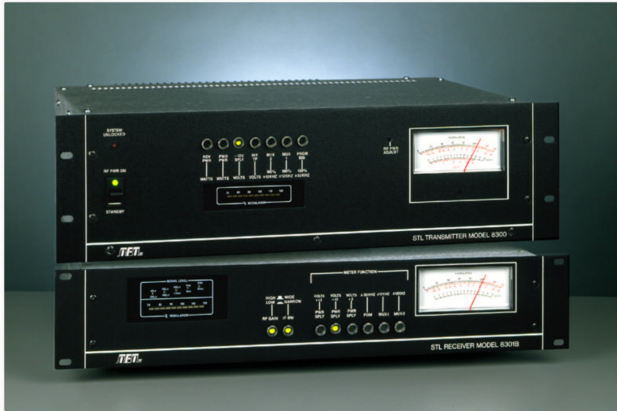
Composite Aural STL and IF Repeater System